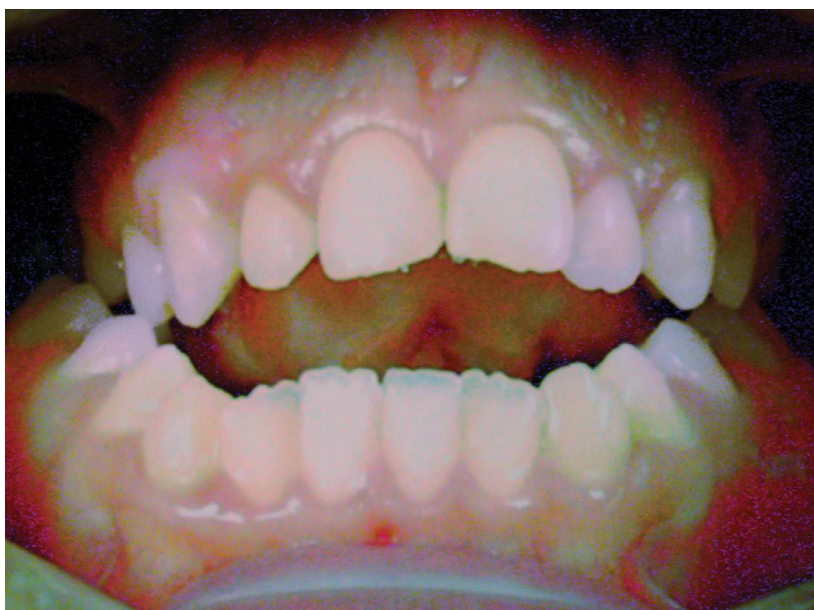
Figure 3 - Characteristic malocclusion.

The lateral and frontal cephalometric radiographs were taken according to the technique proposed by Broadbent 4 and Ricketts. 33 For correct evidencing of the soft tissue profile on the radiographic image, an aluminum filter was attached to the film holder, according to the technique described by Freitas. 16