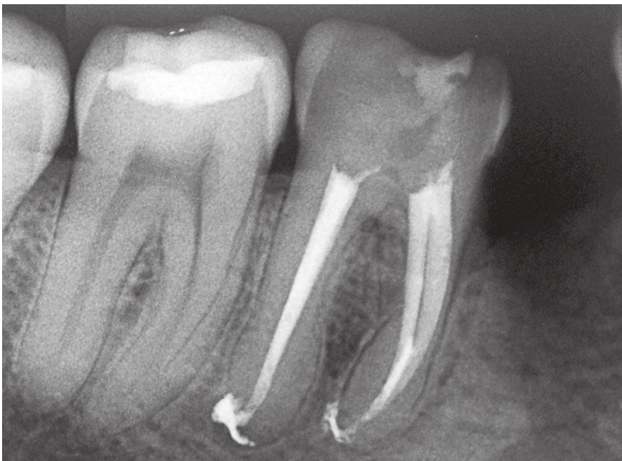
Figure 4. Periapical radiographic follow-up image two years later.