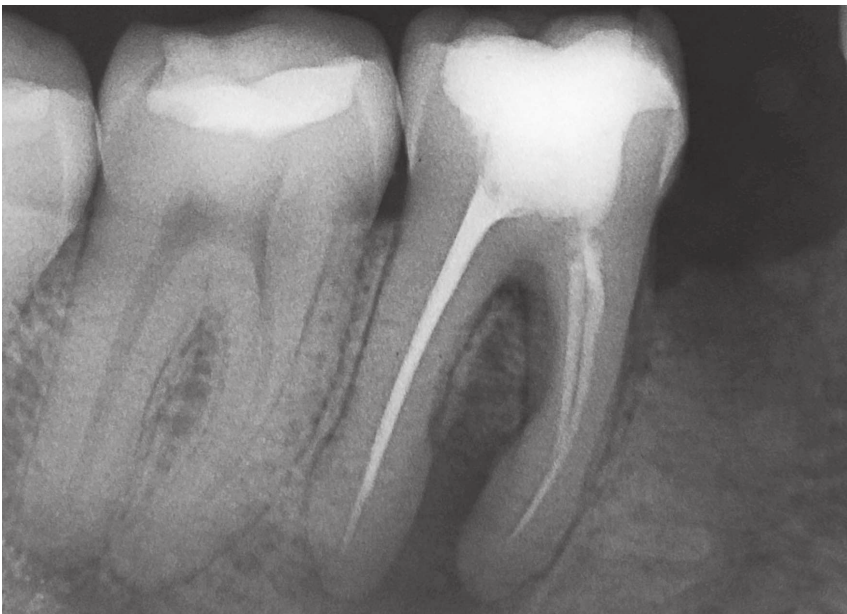
Figure 1. Preoperative periapical radiograph.

distal and mesial root canals, respectively, and endodontic cement (AH Plus, Dentsply, De Trey GmbH, Germany). The case was documented with the aid of an operating microscope (Alliance, São Paulo, Brazil). Follow-up clinical and radiographic examinations (Fig 4) after two years revealed tissue re-establishment and repair of the periapical region, including masticatory and esthetic functions by means of restorative procedure.