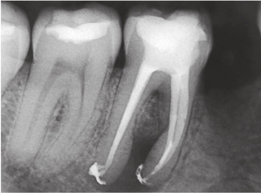
Figure 3. Periapical radiographic image of root canal system filling.