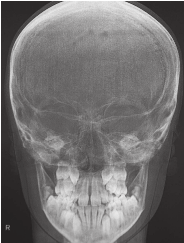
Figure 3 - PA cephalometric radiograph pre-RME.