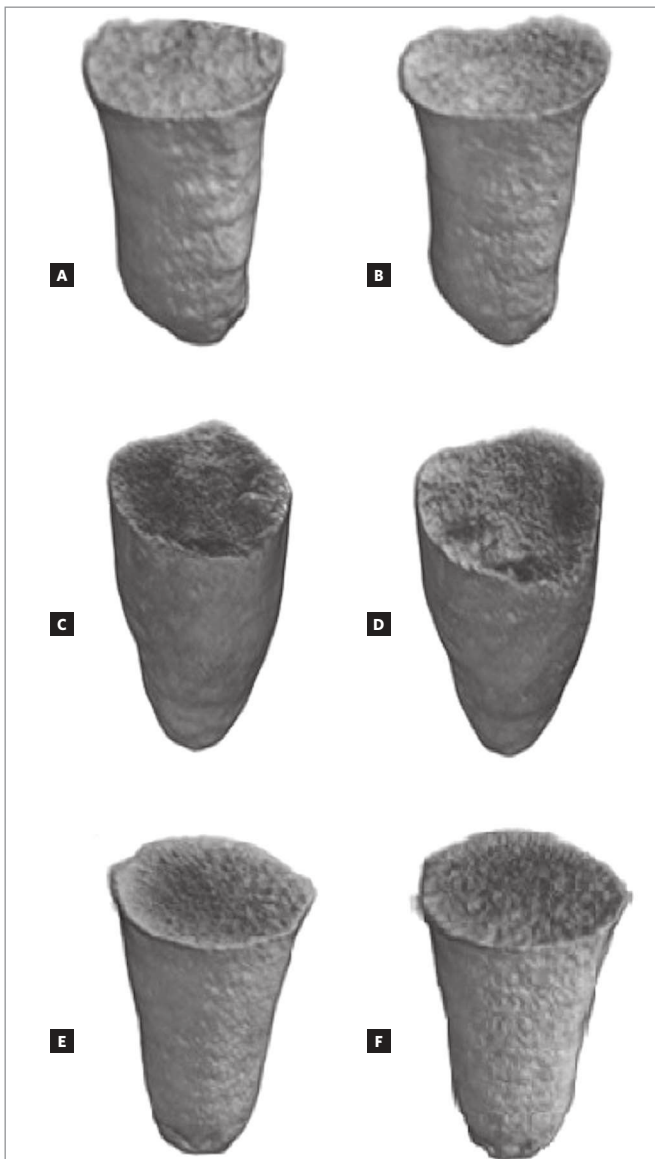
Figure 1. Micro-CT tridimensional reconstructions of the representative samples. Group 1 ( A and B ), Group 2 ( C and D ) and Group 3 ( E and F ), before and after water immersion, respectively.