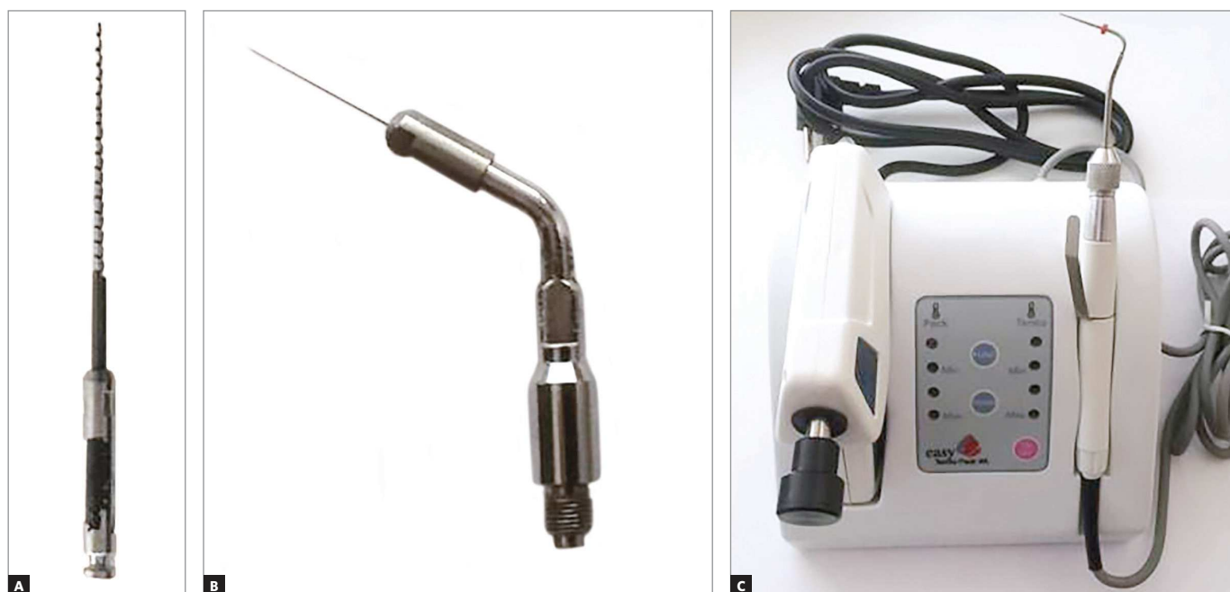
Figure 2. Devices used in the three experimental groups: McSpadden™ compactor (A), bidigital B spreader intermediate component coupled to ENDO L ultrasonic insert (B), and Term Pack WL™ (C).

Root canals in which McSpadden™ compactor (group 1) was used, the following protocol was applied: after placement of the fifth accessory point, gutta-percha cones were plasticized with the aid of